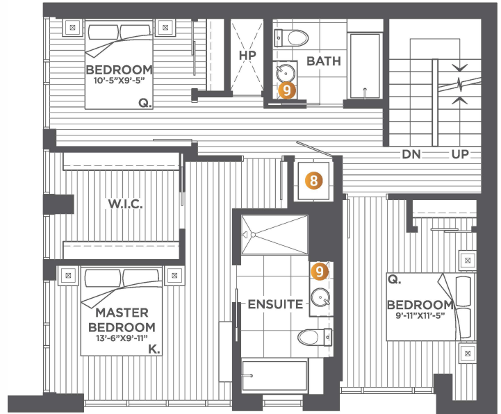
MAIN FLOOR 845 sq ft